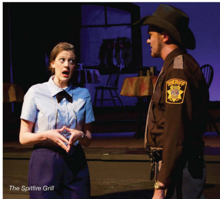
The Spitfire Grill