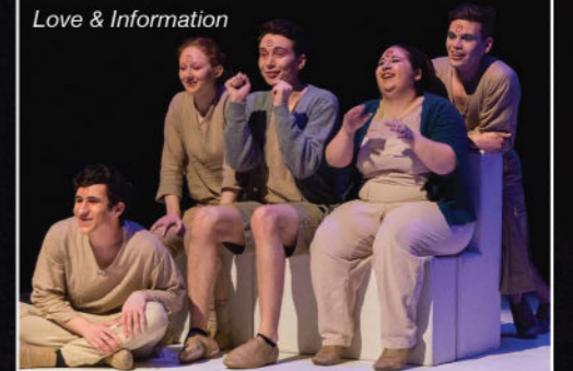
Love & Information