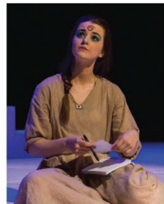
Love & Information