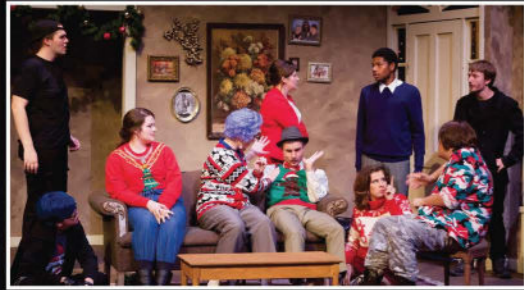
In-Laws, Outlaws, and Other People (That Should Be Shot)

Our program emphasizes practical experience at every level of production. We offer students transformative experiences; students perform, design, direct, choreograph, construct, circuit, paint, sew, write plays, research and teach.